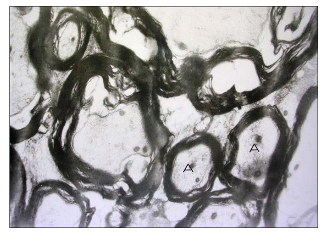
Fig. 2. Electronmicroscopic findings for HA group showing no intraneuronal vacuoles. A: ultrastructure of axons.

nificance was evaluated at p < 0.05 for all tests. All computational work was performed by means of SPSS 17.0 V statistical software e (SPSS 17.0 V; SPSS Inc., Chicago, IL).