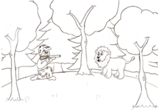
Sample Item 4: We should hunt wild animals.