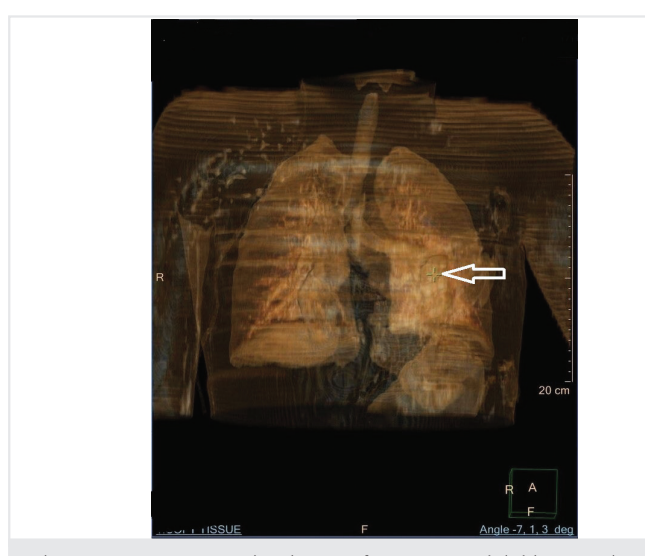
Figure 2. 3D reconstruction image of entry wound (white arrow) and hyperdense consolidation of the left lung

No additional organ injury was detected in the chest. He was followed up in the intensive care unit postoperatively and recovery was uneventful. He was discharged on the postoperative 9<sup>th</sup> day without any complaints. Written informed consent was obtained from the patient for publishing the individual medical records.