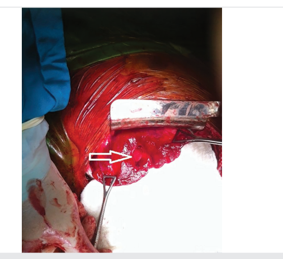
Figure 3. Tissue loss in the lingular segment of the upper lobe (white arrow)

Bullets with a velocity more than 609.6 m/s are called high-energy bullets, whereas those with a velocity less than 457.2 m/s are called lowenergy bullets (6). From a ballistic aspect, BCs act as low-energy weapons, mostly in civilian use. The differential diagnosis between conventional ammunition and BC injury is very complex and almost impossible (2,4,5). This was the case in our report. Initially, we thought it was a